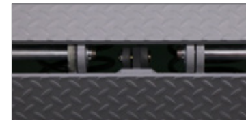
Open lug hinge sheds debris and allows for easy lubrication