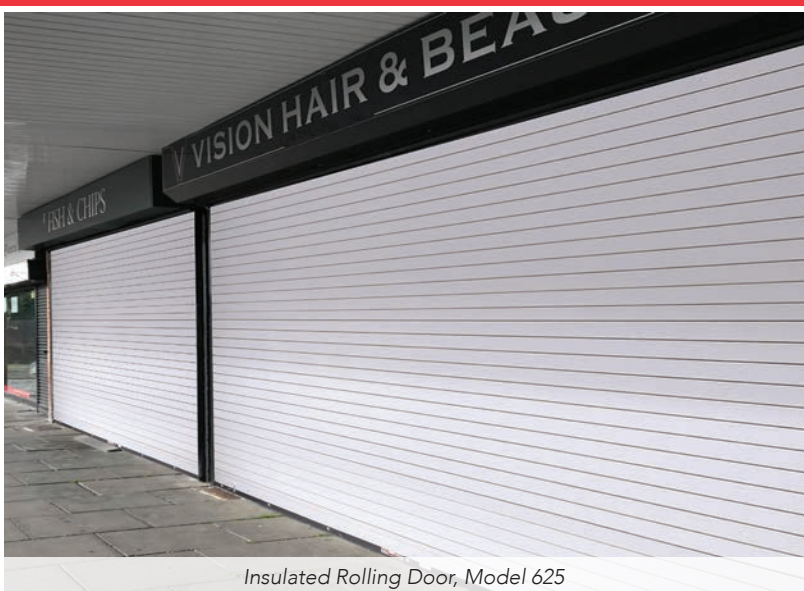
Insulated Rolling Door, Model 625