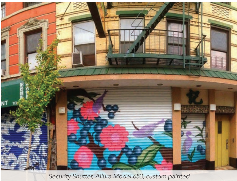
Security Shutter, Allura Model 653, custom painted

The protection of your business is crucial and we are here to help make sure that your store front stays safe and operational. Our comprehensive product line offers security and convenience. From the strongest doors, to the option of visual access or even anti-graffiti powder coat finish, we have your business covered.