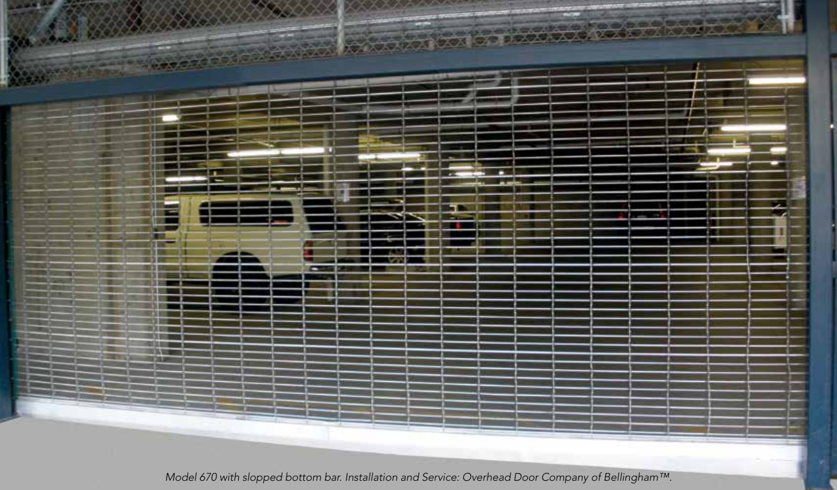
Model 670 with sloped bottom bar. Installation and Service: Overhead Door Company of Bellingham™.