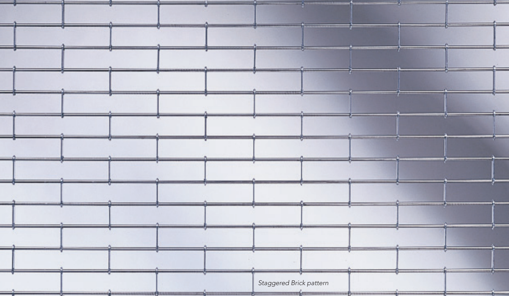
Staggered Brick pattern