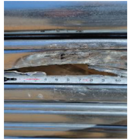
Specimen #3 Center of door, post attack 30 min entry time