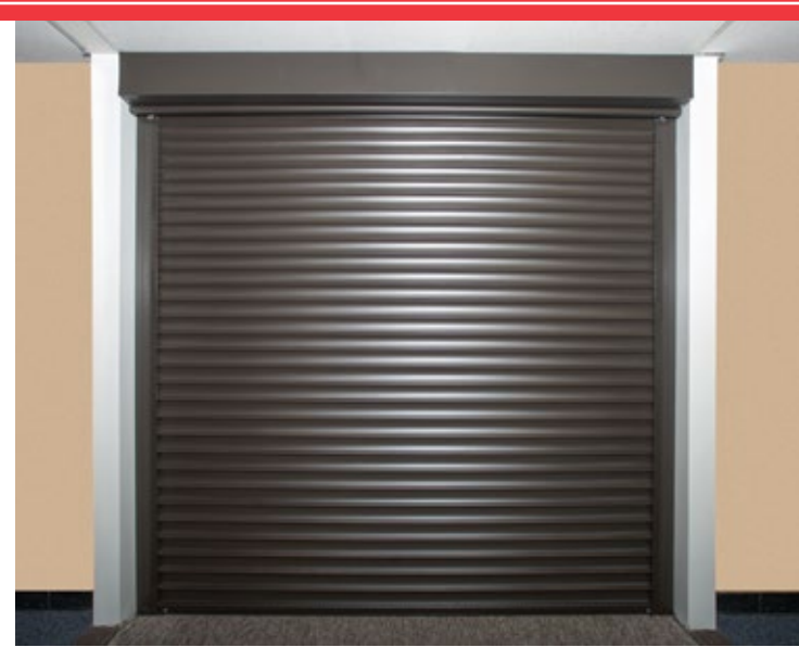
Standard slat, PowderGuard® Premium powder coat finish in Bronze

Allura<sup>®</sup> Model 653 is a next generation light-duty door solution that is versatile enough for specialty uses and has a space-saving design, making it perfect for installations with limited side room and headroom. Multiple perforation and fenestration options allow for many configurations with the right amount of light and air passage.