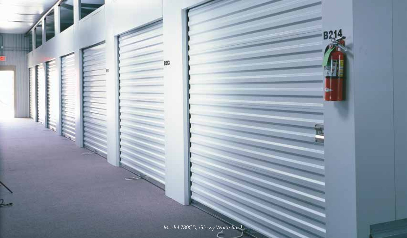
Model 780CD, Glossy White finish