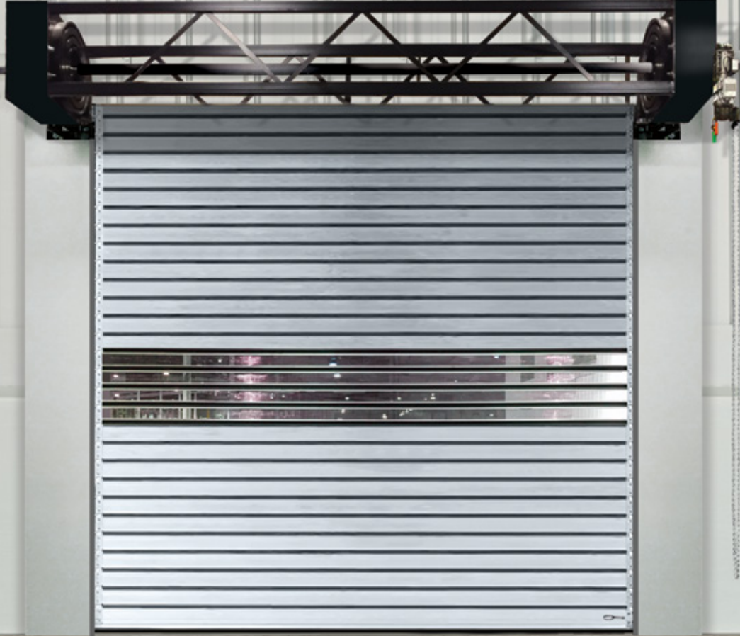
RapidShield® Model 998 with optional vision slats