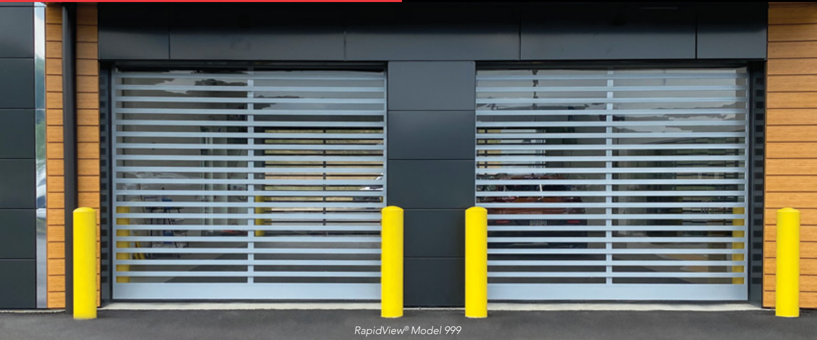
RapidView® Model 999